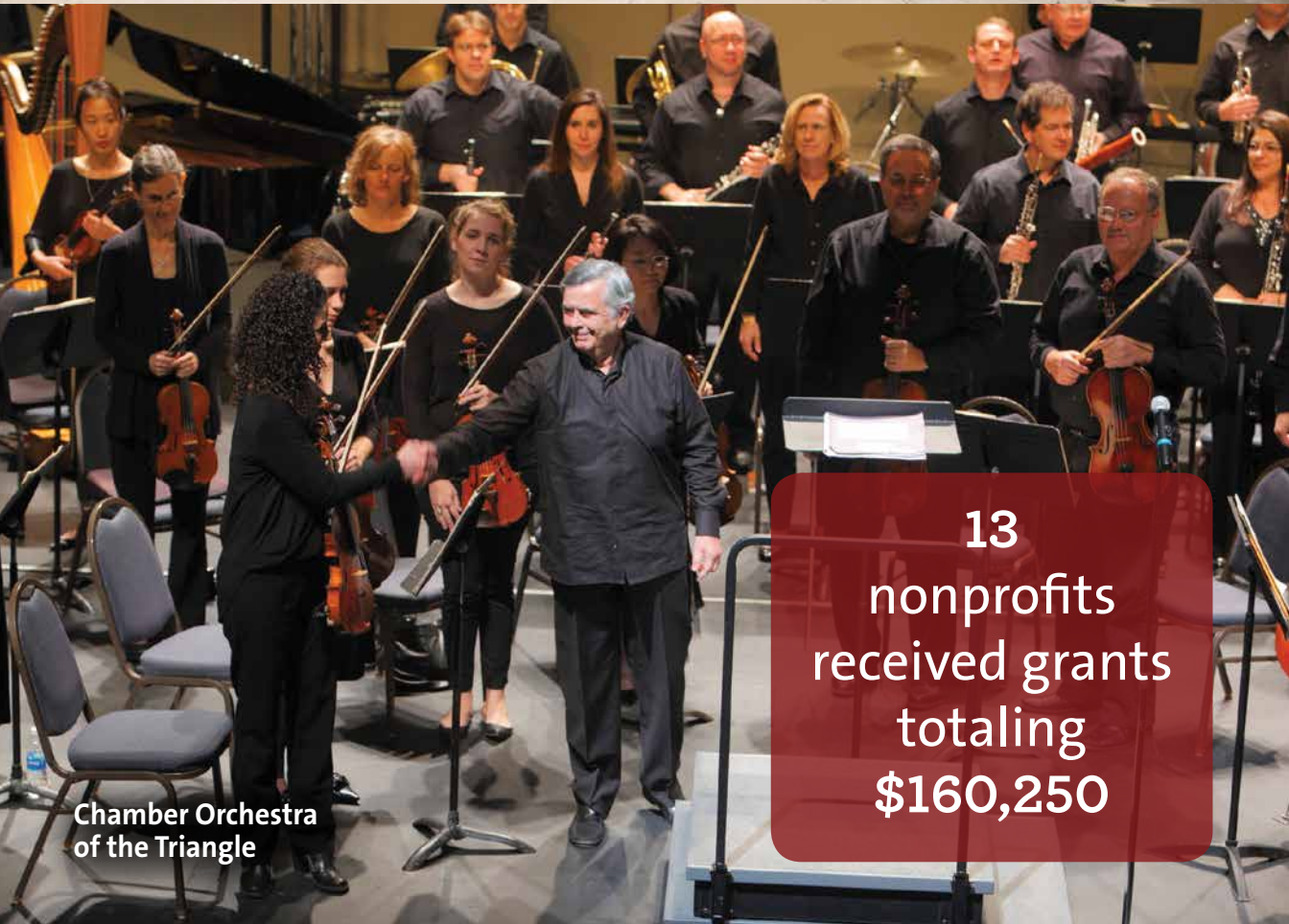
Chamber Orchestra of the Triangle

13 nonprofits received grants totaling $160,250